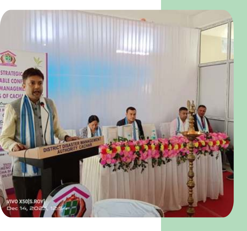
Silchar, Cachar | December 14, 2023