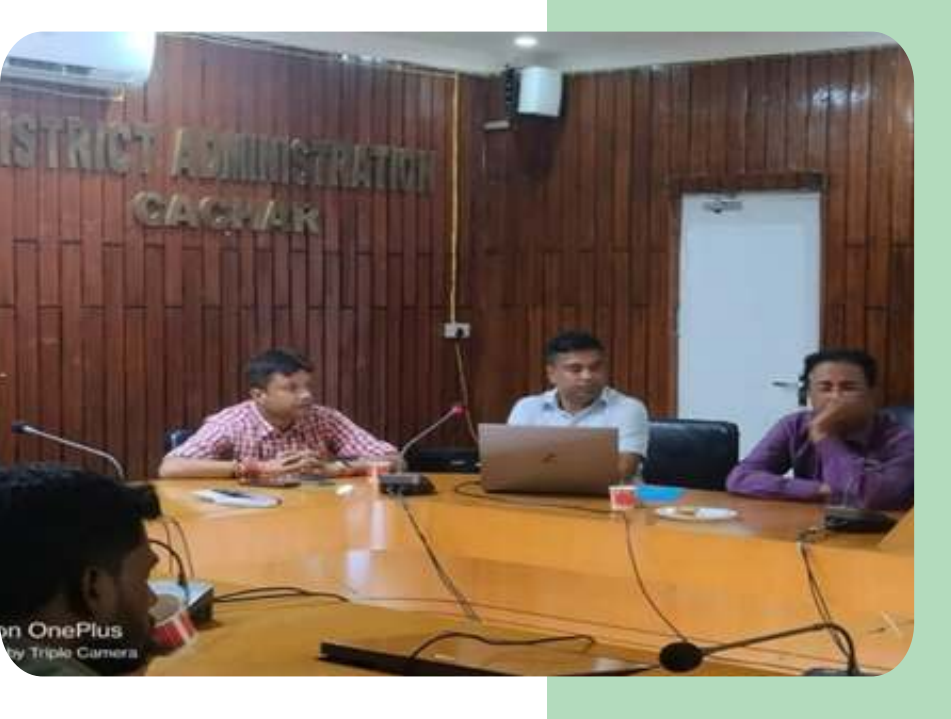
Silchar, Cachar | October 10, 2023

A pivotal District-level School Safety Advisory Committee meeting took place on October 10, 2023, chaired by ADC & CEO DDMA, Cachar the meeting was attended by DMC, SSA, Cachar, and other committee members, who delved into detailed discussions relating to NSSP-2016 (National School Safety Program)