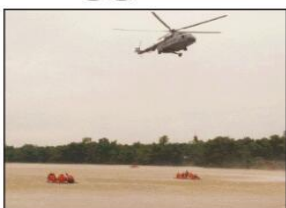
Mi-17 helicopter of Indian Air Force displayed risky rescue operations on River Barak during the drill. NCC cadets are participated in large numbers.

The mock exercise and demonstration started with early warning of heavy rains which started at 10 am on the day. It began with an aerial reconnaissance by the Mi-17 helicopter of the Army Aviation. On assessing the criticality of the moment, flood control teams from NDRF, SDRF and Indian Army with a high speed action to rescue the victims from a mock island, depicted by a barge in the river. The exercise in the form of a mock drill and demonstration was conducted on settings akin to near simulated real situation of flood. The entire