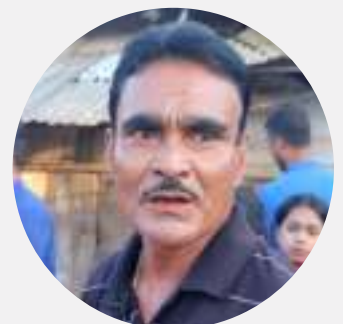
Resident of Baskandi