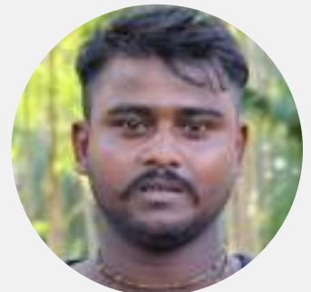
Resident of Kalain