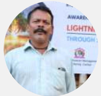
Resident of Mailinibeel

I never expected that there would be so many preventive measures to tackle such situations. Through the street play, I got to know many things. Best wishes to everyone for such a fantastic play.