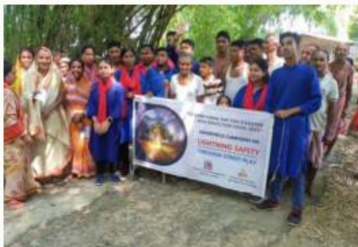
VIVEK HOME SENIOR SECONDARY SCHOOL