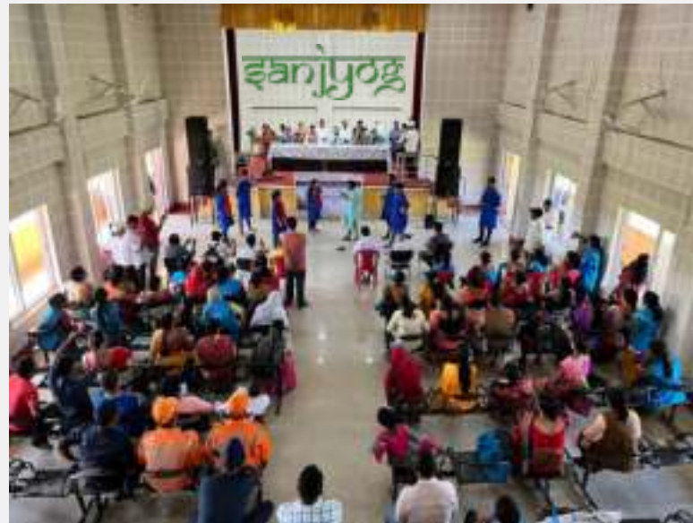
Street play performance at the inauguration of CFRC at Borkhola